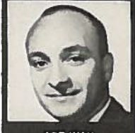
ART WAY 9:00 - 12:00 Noon