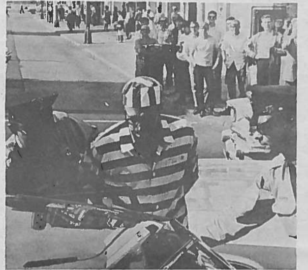
BUT OFFICER, this isn't the car I came in!

At 9:50 p.m. the $10,000 goal had been reached and Earl got out of jail, but the money was still coming in. One pledge of $1000 was received. ALSAC officials indicated that the final total might exceed $20,000. Last year $6000 was raised.