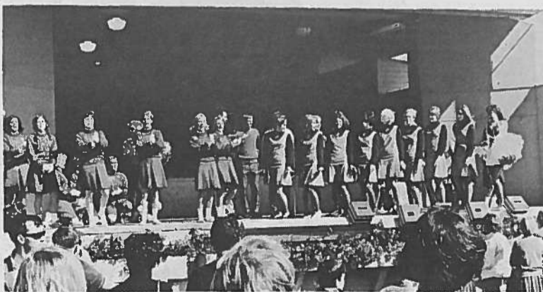
RAH! RAH! Robbinsdale Cheerleaders on stage.

There was even a prize of $100 from Dayton's to the school having the biggest turnout. The money goes to the school's AFS Fund (American Field Service). Robbinsdale High School was the recipient.