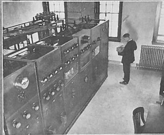
Panels at the Anoka Station