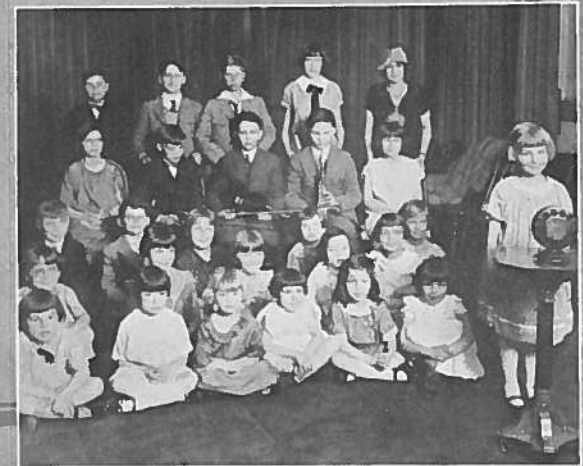
A Group of the Junior Artists