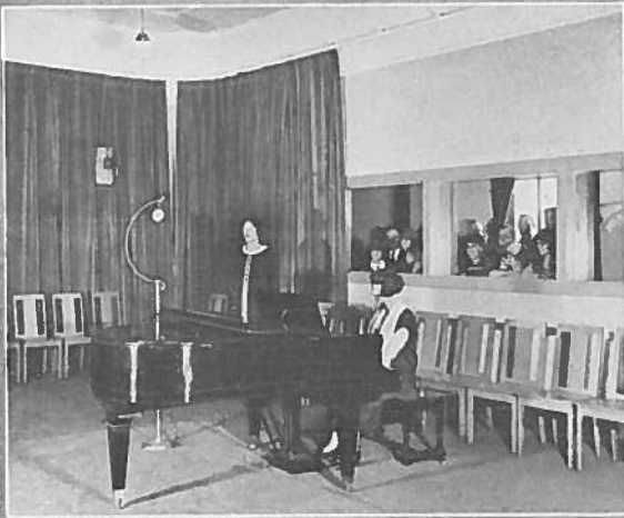
The Minneapolis Studio and Visitors' Gallery.