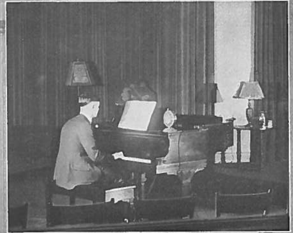
A corner of the St. Paul Studio