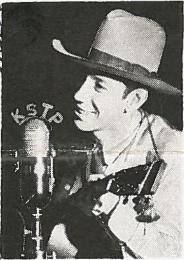
CACTUS SLIM The Lonesome Serenader