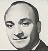
ART WAY 9:00 - 12:00 Noon